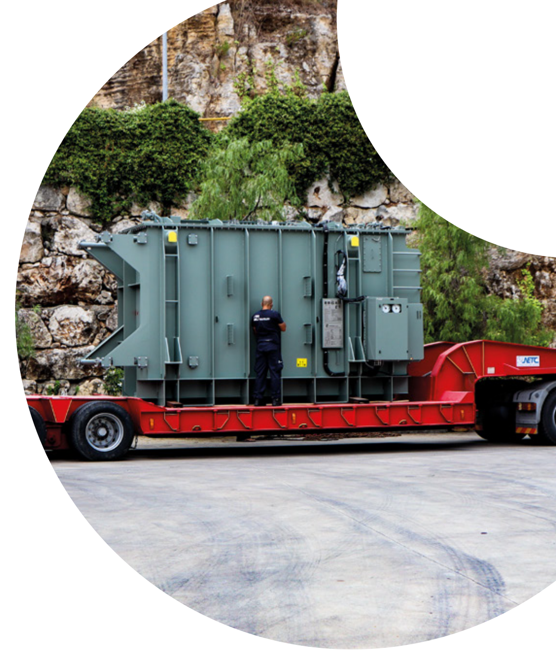
*Door to Door Deliveries to Iraq, 2018

Over weight and over dimensional transports: we cover land shipments that are characterized as massive volumes or that require special and customized freight solutions.